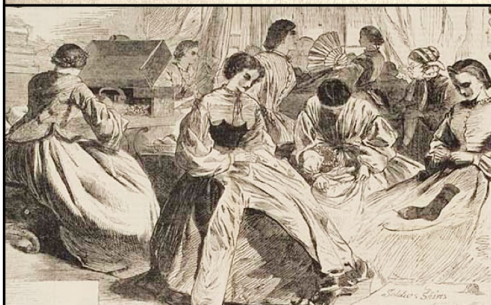
Ladies Aide Quilters 1860's

Mon. & Thu. Oct. 14 & 17 8:30am-noon, Social Hall