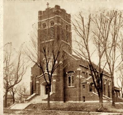
New Norwegian Lutheran Church, Northfield, Minn.