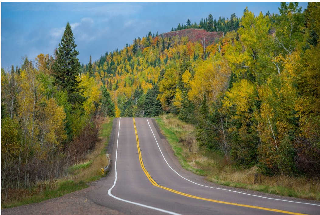
Image captured on October 4, 2016 along the boundary of Tettegouche State Park.